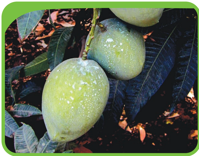
Figure 23: Copperoxychloride residue left on fruits after spraying. If good coverage is achieved on all sides of the fruits, and provided that this cover is maintained, pre- and post-harvest diseases should be adequately controlled.