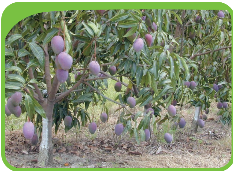
Figure 41: Increased fruit retention realised in "Tommy Atkins" as a result of proper flowering-time management.