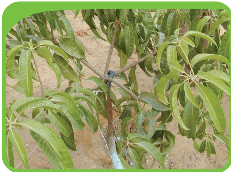
Figure 9: Primary branches requiring upward support as they are growing at angles of less than 45° from the horizontal.

Branches should be pushed up to at least 45° from the horizontal if they are growing at lesser angles.