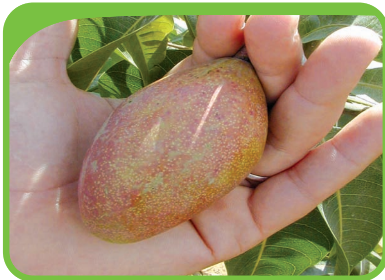
Figure 16: Anthracnose "haloed lesions" at the stem-end of a young "Palmer" fruit.