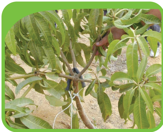
Figure 10: The branches should be pushed-up, held and maintained in an upward position

Support is particularly important in trees that tend to flop over, such as those of “Keitt” or “Alphonso”. Branch strength, and thus the tree’s ability to grow upward, is partially dependent on nutritional balance. High N - low K fertilization programmes give rise to the development of thin, weak branches initially.