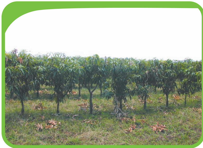
Figure 51: "Tommy Atkins" 3 m x 1 m planting: The trees after post-harvest topping.