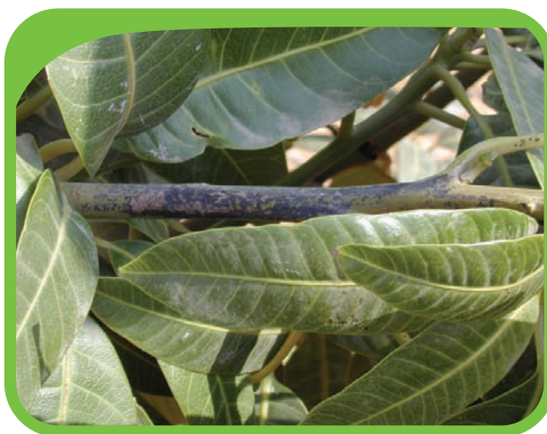
Figure 48: Solar injury resulting from sun exposure due to branch bending.