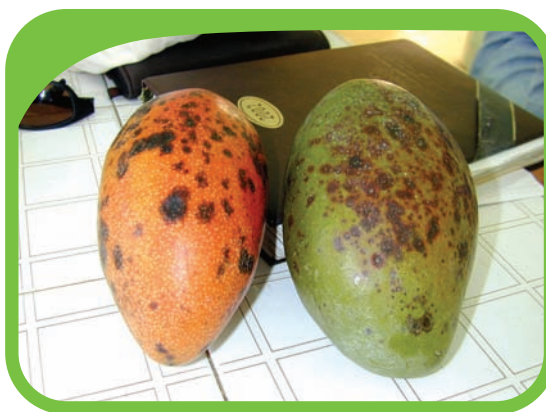
Figure 15: Anthracnose lesions on a ripe and on an unripe mango fruit.

Anthraxnose is controlled by regular copper spraying. It is caused by the fungus Colletotrichum gloeosporioides .