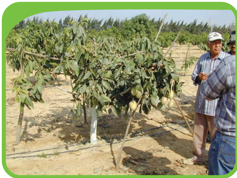
Figure 47: A "Keitt" tree in Egypt developing long branches due to failure to encourage branching by tipping. A trellis is supporting the long branches. Due to branch bending, fruits and inner branches become exposed to the sun, this resulting in solar injury. The reduced number of terminal shoots limits cropping potential, which is primarily due to a reduced leaf and terminal shoot number.