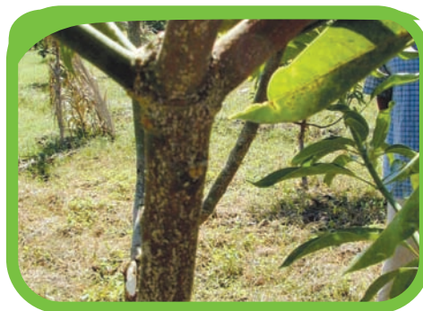
Figure 25: Palm scale occurring on the branches of a mango tree. The affected branches should be painted with mineral oil containing a pesticide.