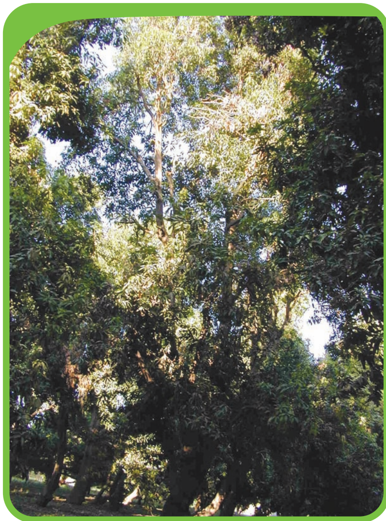
Figure 57: Mango forest on a bank of the Nile River in the Luxor region, Egypt. Mangoes are generally only born where the canopy is exposed to light. The forest interior is shaded and open. Orchard productivity is low, often not exceeding 4 MT per feddan (0,4224 ha), or 9,5 MT/ha.