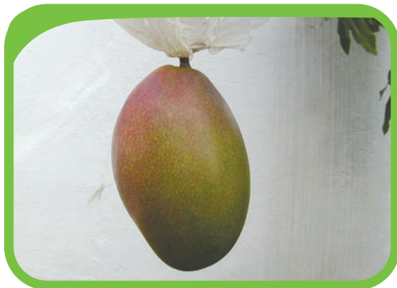
Figure 44: Enhanced colouration and superior quality attained following the application of a protective sleeve.