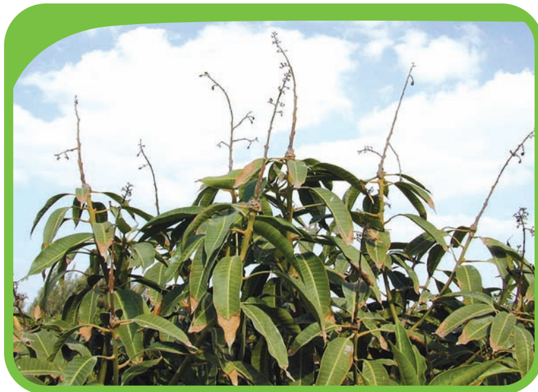
Figure 18: Blighted inflorescences. Inflorescence blight is controlled by the application of curative fungicides during the flowering period.

Soft-brown rot is caused by the same pathogen causing inflorescence blight and blight of young fruits.