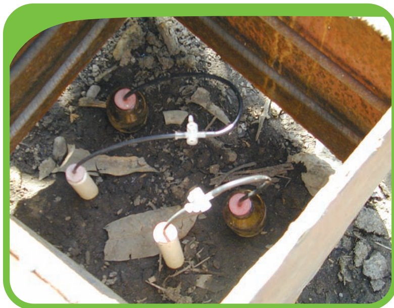
Figure 30: Soil suction tubes used to obtain water for the determination of soil water EC (and pH) immediately after an irrigation.

The salt concentration of the soil solution increases after irrigation as a result of evapotranspiration. The frequency and duration of irrigations should be such that the concentration of salt in the soil solution never rises to the extent that salt burn will occur. An EC of 2 mS/cm may be considered the upper limit. Soil suction tubes can be installed to enable the assessment of the soil water salinity level immediately after an irrigation.