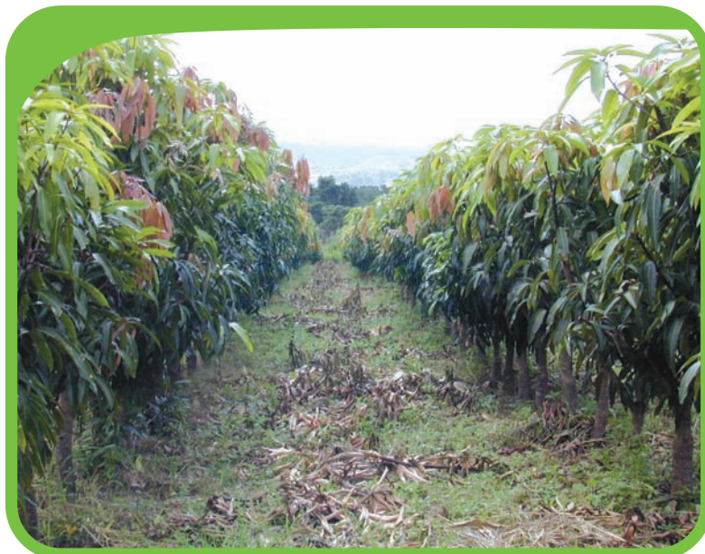
Figure 53: "Tommy Atkins" 3 m x 1 m planting: Between-row clearance (2 m) achieved after side-pruning.