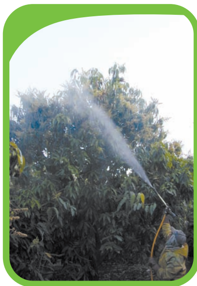
Figure 34: Nutrient spraying during flowering for improved uptake.

Ultrasol™ K spraying during flowering is effective in reducing post-flower drop of seeded fruits, thereby increasing yield. Two 2% (w/v) applications are made, the first at the start of flower opening (anthesis), and the second, when the inflorescences are in full-bloom.