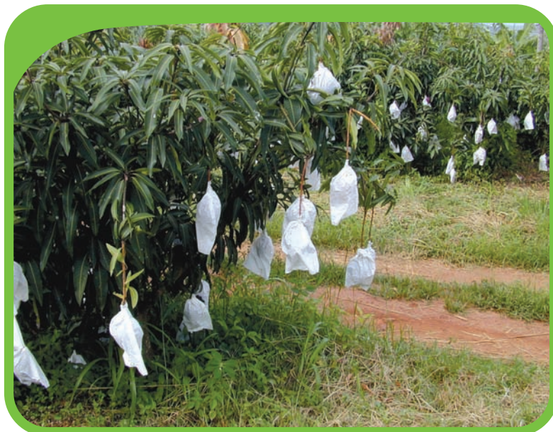
Figure 55: "Tommy Atkins" 3 x 1 m planting: Protective sleeves are used with great success by "organic" mango producers.