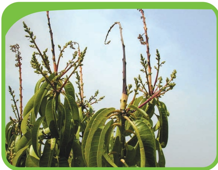
Figure 36: Inflorescence re-development in "Kent" after chemical desiccant application.

Products have been developed in South Africa to chemically remove the first inflorescences to develop.