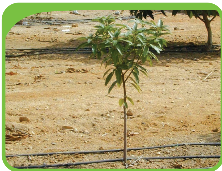
Figure 7: A tree whose new shoots are to be tipped after each flushing episode. The strong new shoots are to be tipped in each instance. Note the vertical trunk that is 0,8 metres high. The trunk is to provide sufficient canopy clearance from the orchard floor.

The strong new shoots should be tipped after every flushing episode during the period of active growth (spring and summer). If flowering is the next growth event to occur, this being the situation in autumn, tipping is not performed.