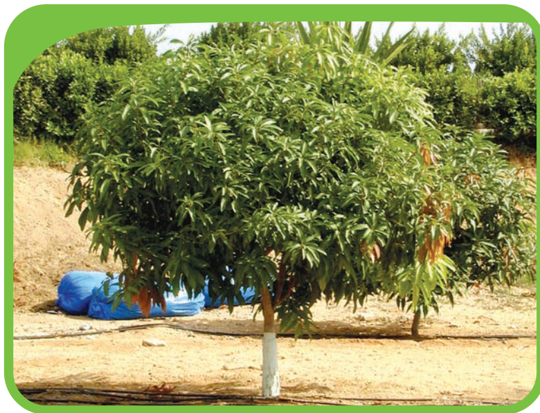
Figure 12: A tree attesting to the effect of tipping for two seasons; it being large, sturdy, and comprising many terminal shoots. Note that the branches are well off the ground and that there is a clear and distinct trunk above which the canopy arises (this tree has not yet been permitted to crop).

Branch sections inside the canopy during the first years after planting should not exceed 30 cm in length. If the branches exceed this length, undesirable branch bending under the weight of fruits or new terminal shoots will occur.