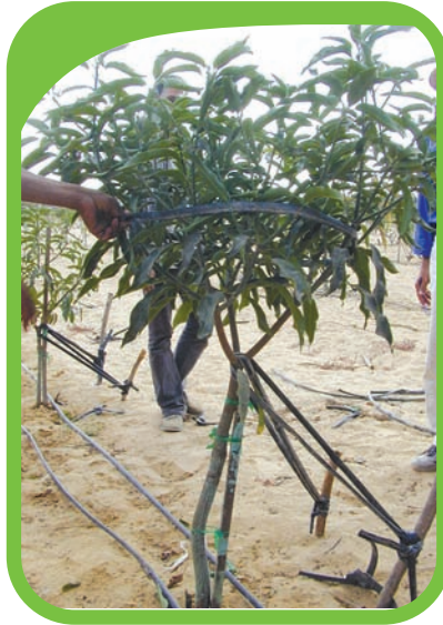
Figure 8: The primary branches should grow at angles of at least 45° from the horizontal.

Branches should be pushed up to at least 45° from the horizontal if they are growing at lesser angles.