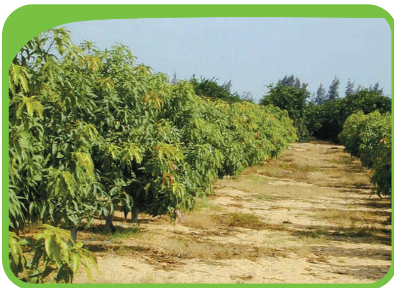
Figure 1: An orchard where hedgerows have become established.

Those wishing to adopt the high-density system should have a sound knowledge of the management procedures required in managing the system. For example, canopy size maintenance pruning, when it is due, is a critical factor for the system's success.