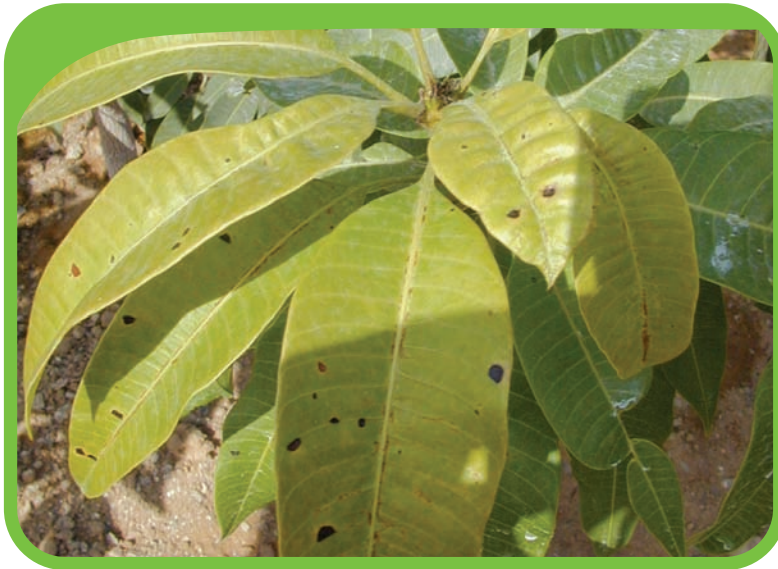
Figure 13: Bacterial black spot "angular" lesions on mango leaves.

Bacterial black spot is making its appearance in orchards worldwide. The disease may spread as a result of the distribution of infected grafting material. It is caused by an epiphytic bacterium (generally, Xanthomonas campestris ). Lesions form when the bacterium enters the plant through wounds or natural openings like lenticels. "Kent" and "Keitt" trees are particularly susceptible. A high incidence of this disease is often noted at windy sites, due to wind exposure resulting in wounding. Affected fruits typically weep from star-shaped lesions.