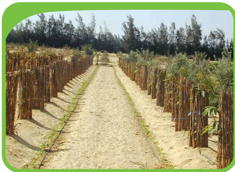
Figure 2: A new planting (4 m x 2 m) where the in-row and between-row spacings are such that hedges will form quickly, and where the ideal tree height is "low" (2,4 m).

Hedge width control can be similarly achieved. After harvest, branches at or exceeding the desired tree-width are headed back. Heading cuts are made 30 to 40 cm less than the desired width on each side of the hedgerow to cater for re-growth. Side pruning should be carried out every year immediately after harvesting. Yearly, relatively non-severe side-pruning is required for success of the system.