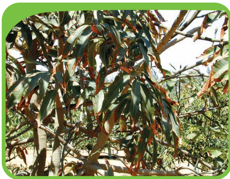
Figure 29: Leaf burn due to the tree having taken up too much salt. The damaged leaves generally fall. The tree takes time to recover, and as a result, yield is lost. If salt damage is experienced regularly, tree decline occurs.