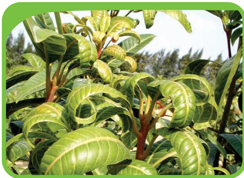
Figure 31: Abnormal terminal growth resulting from trace element deficiency.

In arid regions, trace element sprays should also be applied regularly. Monthly or three-weekly applications during spring and summer should be made, i.e. when active growth and development is occurring. The trace-element product used should contain Cu, Fe, Mn, Zn, B, and Mo. The exclusion of any one of these elements is not recommended, particularly in view of leaf analysis results showing deficiency in all where the high soil pH condition exists due to an elevated level of calcium carbonate.