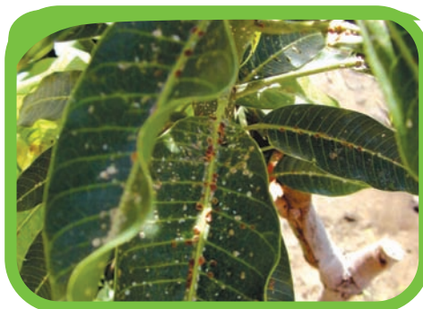
Figure 24: Scale occurring on mango leaves. Scale is often associated with sooty mould on the upper (adaxial) side of the leaf.

Scale, mealybug, thrips, aphid, fruit-fly, and mango weevil are common pests in mango. Spraying the trees when the inflorescences are in full-bloom with a suitable pesticide is effective in preventing thrips damage on young fruits. This spray also affects scales occurring on the leaves, as well as aphid and a number of the other pests. The inflorescences should be made properly wet when spraying.