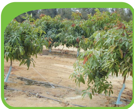
Figure 11: Where the soil is particularly sandy, the entire tree may require support to keep it upright. This is important, especially in top-heavy trees resulting from a canopy made to develop quickly as a result of tipping.

Support is particularly important in trees that tend to flop over, such as those of “Keitt” or “Alphonso”. Branch strength, and thus the tree’s ability to grow upward, is partially dependent on nutritional balance. High N - low K fertilization programmes give rise to the development of thin, weak branches initially.