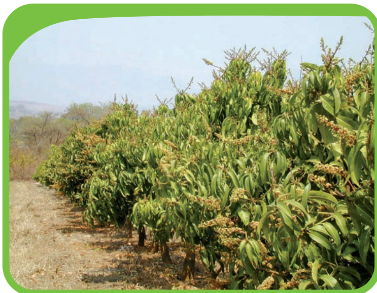
Figure 37: Re-flowering of "Kent" during conditions more favourable for seeded set.