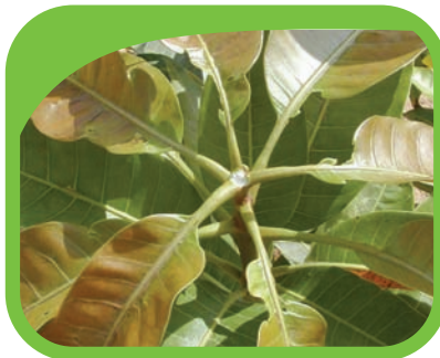
Figure 6: In tipping, only the terminal bud is removed. The thicker, more vigorous terminal shoots are tipped after each flushing episode.

After planting and heading at the desired height, the strong new shoots arising after heading are tipped. The weaker shoots should not be removed. They are valuable in that they contribute to the tree's growth.