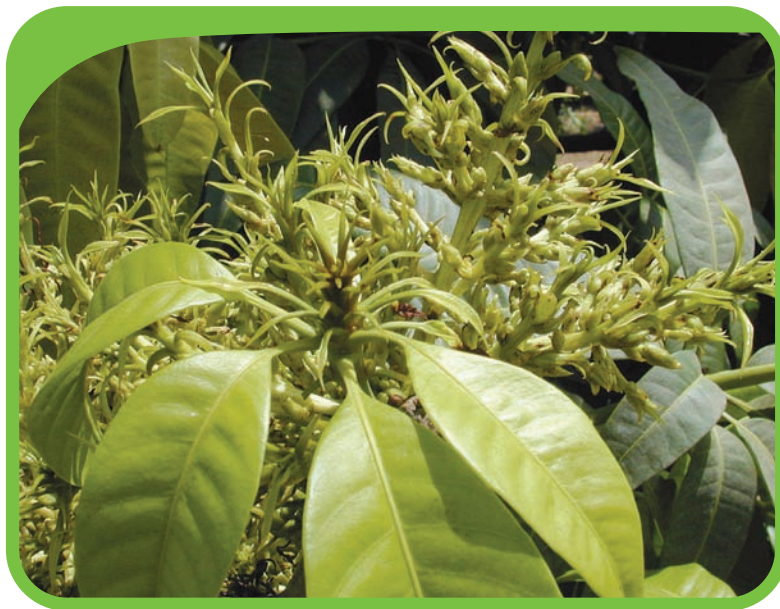
Figure 22: Inflorescence and vegetative malformation.

Precise identification of the causal fungus is still being debated. Regular copper spraying controls blight.