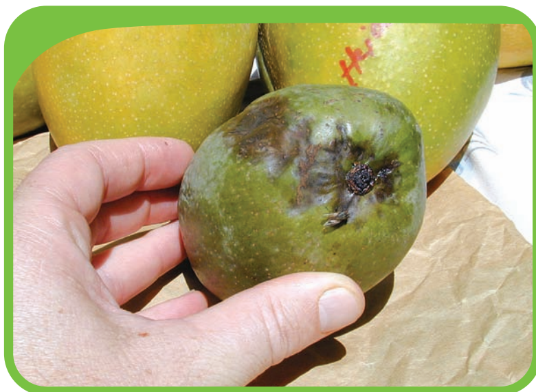
Figure 17: Soft-brown rot at the stem-end of a mango. This disease is caused by the pathogen also causing inflorescence blight and blight of young fruits.