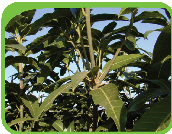
Figure 46: Out-growth occur- ring after terminal bud removal (tip- ping). Note the strong shoots whose growth has been supported by the terminal leaf-rosette of the tipped shoot. Close lateral bran- ching should not be considered a prob- lem in mango.