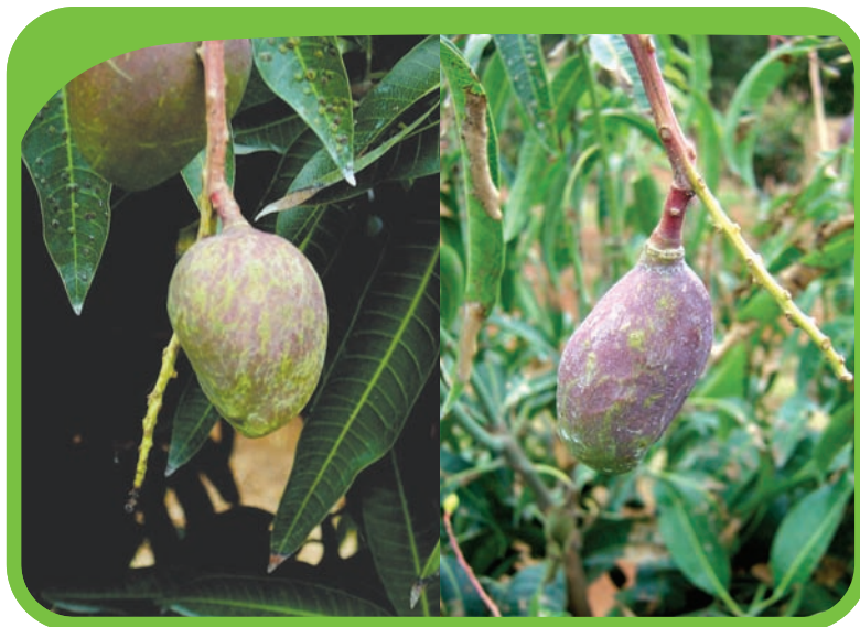
Figure 26: Thrips damage on young mango fruits.

Removing the shaded leaves and short branches inside the tree canopy is an effective measure to limit scale and mealybug. This measure also enhances spray penetration.