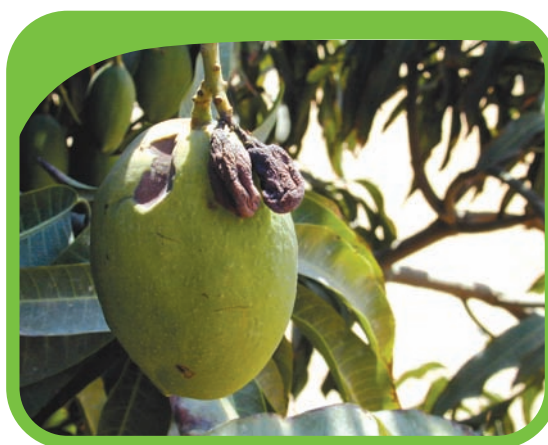
Figure 19: Blighted young fruits and a blight lesion on a young developing fruit. Partial blighting of young fruits is a major cause of fruit-drop in mango. In partially affected fruits, indented lesions appear which may become imbedded in the fruit.