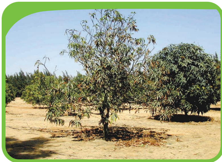
Figure 28: A tree having lost its leaves due to excess salt uptake.