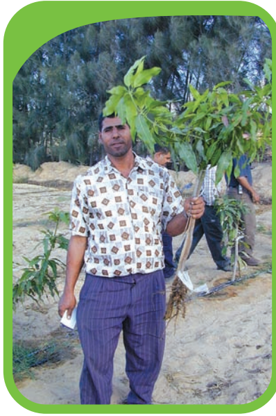
Figure 5: Newly planted trees showing signs of malfor- mation should be uprooted and discarded.

Mango malformation is caused by a pathogen thriving in the tree's tissues. It is only when the concentration of the pathogen in a developing region of a tree is high enough, that malformation symptoms become apparent. The pathogen ( Fusarium subglutinans ) produces natural plant hormone. It often effects sufficient hormone-imbalance in a portion of a tree to cause distorted growth and development of the tree portion. Malformed new shoots or inflorescences arise as a consequence.