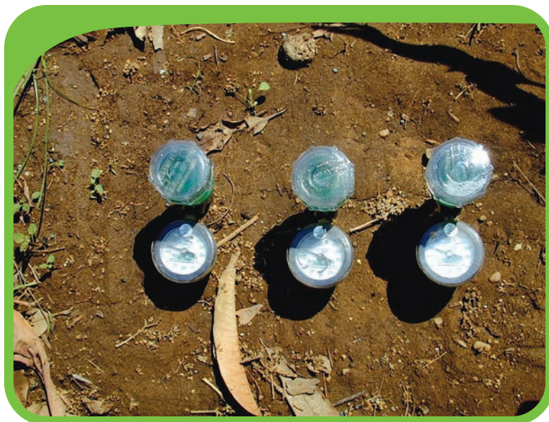
Figure 27: A tensiometer station installed in a soil containing enough clay. The frequency of irrigation is indicated by the 30 and 60 cm tensiometers and the duration of irrigation by the 90 cm tensiometer.

If the clay content of the soil exceeds 10%, tensiometers can be used to schedule irrigation. A tensiometer station may comprise a 30, a 60 and a 90 cm "depth-reading" tensiometer. Proper scheduling results in savings of water and electricity, and facilitates the avoidance of salt-burn of the leaves. The water requirement of trees in flower or trees bearing fruits is much higher than that of trees whose branches are only terminated by mature leaves. Tensiometers adequately indicate changes in water demand. Tensiometer reading maintenance of between 0 to - 35 kpa is generally adequate in the 30 and 60 cm tensiometers. Stress imposition (- 70 kpa tension or slightly less) should only be a consideration in regions where climatic conditions during the winter months do not adequately induce flowering.