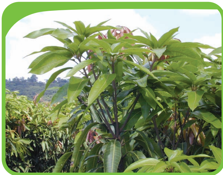
Figure 52: "Tommy Atkins" 3 m x 1 m planting: Re-growth occurring after post-harvest topping.