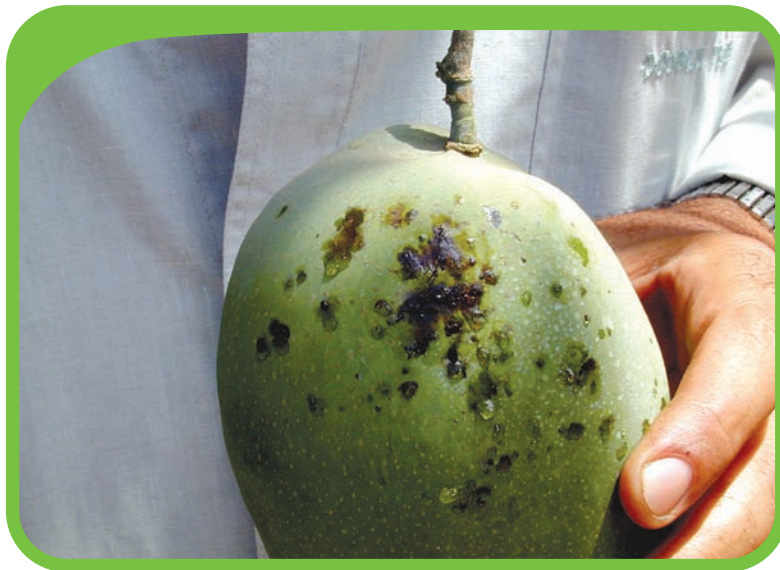
Figure 14: Bacterial black spot lesions on an Egyptian mango fruit.

Anthraxnose gives rise to singular, black indented lesions on the fruits, and non-angular black or brown spot-lesions on the leaves and inflorescences. A reddish halo around spots on young fruits indicates anthracnose infection.