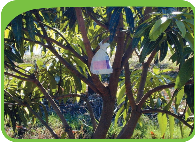
Figure 40: A temperature logger inserted in a "Keitt" tree.