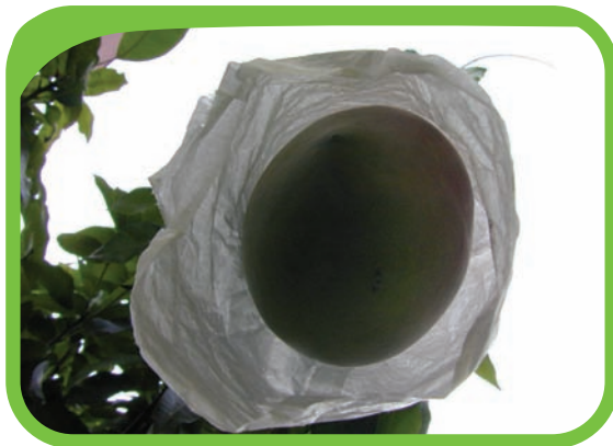
Figure 43: Sleeve made from a composite material. It protects the fruits and enhances blush and ground skin colouration.

Protective sleeves for mango have been developed in South Africa. They have the benefit of enhancing skin colouration and protecting the fruits from the hazards of disease, small hail, and solar injury, and preventing damage resulting from wind exposure and insect pests.