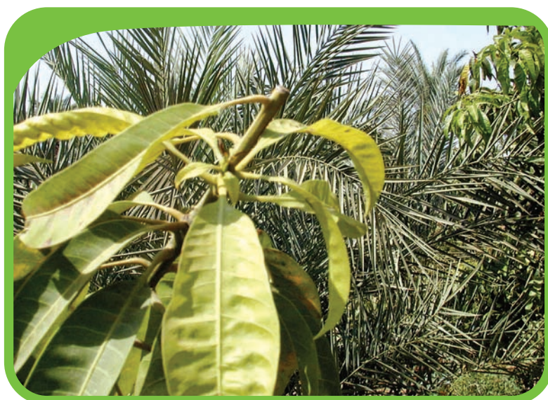
Figure 33: Terminal shoot chlorosis and stunted growth resulting from Zn and Fe deficiency.