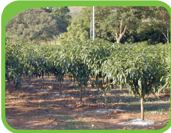
Figure 45: Young "Keitt" trees having been trained as advocated. Note the champagne glass shape and the erectness of the trees.

Many of the following photographs are of trees in South Africa, and are of relevance to the previous chapters.