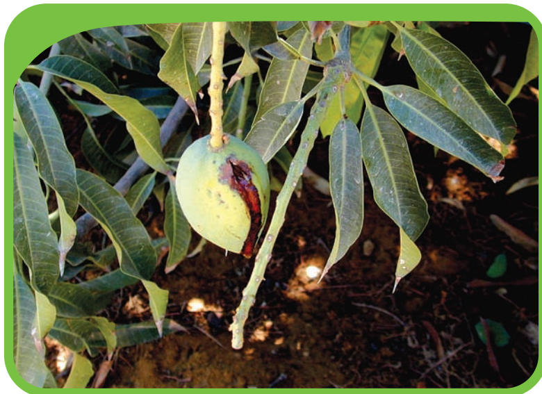
Figure 20: Blight lesions on young fruits may weep and can be confused with solar injury.