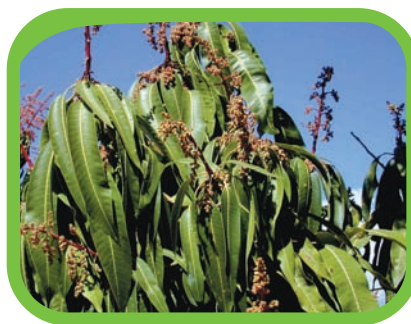
Figure 35: Chemical inflorescence removal. Inflorescences desiccated chemically, which are about to abscise.

The decision regarding breakout is made with the aid of a computer model. The temperatures experienced from the start of inflorescence development are used to determine what is referred to as the "Set Index". The ability of inflorescences to set seeded fruits depends on the flowering temperature-profile, and not only the minimum daily temperatures experienced by the trees during the period of inflorescence development and flowering.