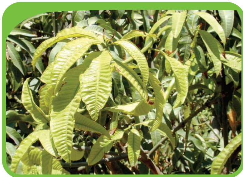
Figure 32: Terminal shoot chlorosis resulting from trace element deficiency.