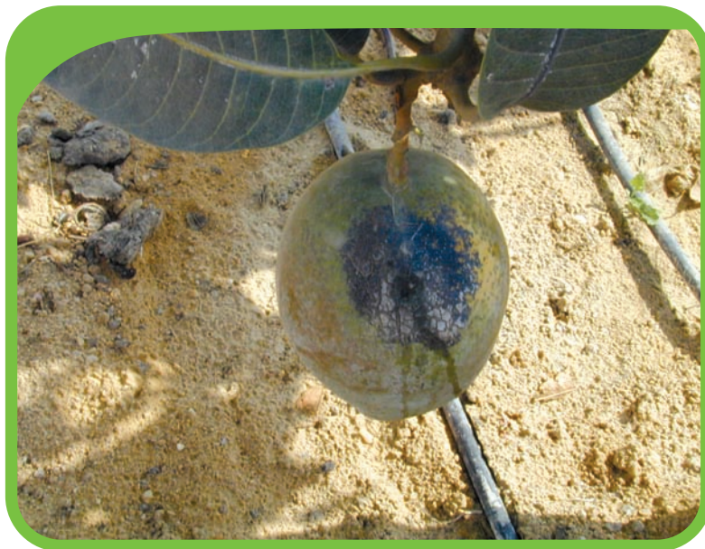
Figure 49: Solar injury on a "Keitt" mango. In "Keitt", protective sleeves are particularly useful, since the fruits are highly susceptible to solar injury. Harvesting occurs late in the season, and the fruits are often large, having the capacity to bend the branches substantially.