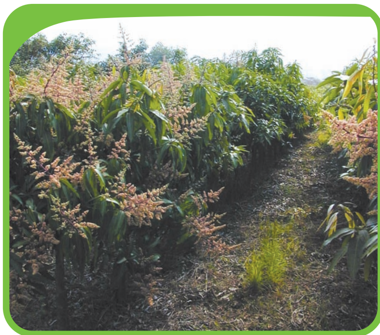
Figure 42: Failure-to-flower is generally not a problem in regions experiencing daily minimum temperatures of less than 12°C and daily maximum temperatures not exceeding 25°C during the coldest month of the year. Increased tree vigour, imparted by heavy pruning, may negatively impact on tree flowering intensity.

A number of measures can be adopted to enhance flowering in mango. The implementation of a relative drought stress during the winter months, and pre-flower Ultrasol™ K applications, are examples. Flowering enhancing measures should only be taken if they are indeed necessary.