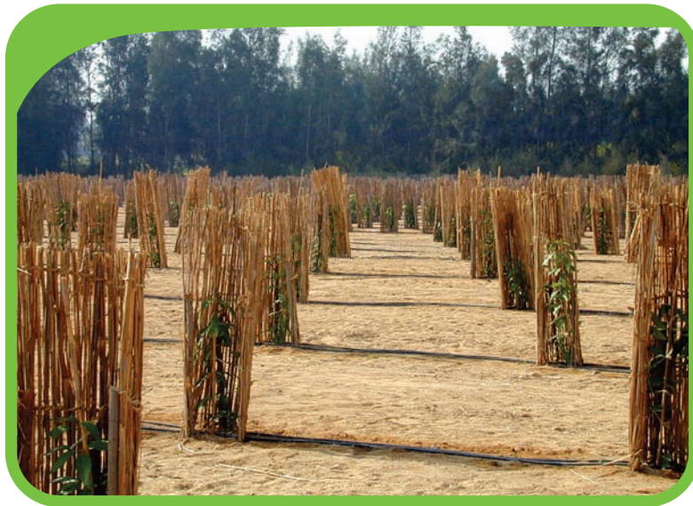
Figure 3: Newly planted trees requiring support and wind protection.

It is important to note that the hedgerows should be oriented north-south.