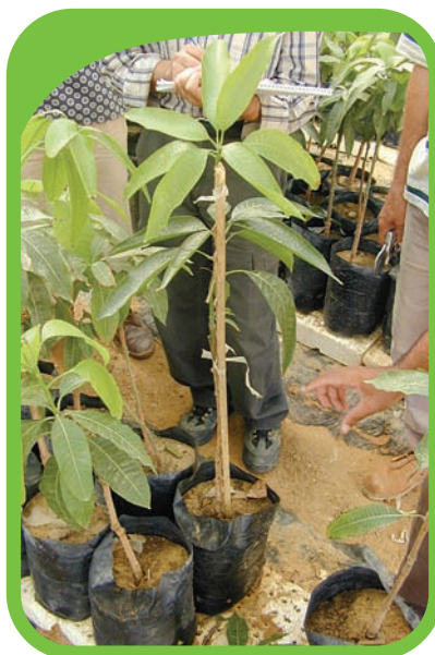
Figure 4: A tree to be planted-out should be staked, and should exceed 0,8 metres in height. In "Keitt", the plant-out height should exceed 1 metre.

It is preferable that trees taken from the nursery exceed 0,8 m in height (1 m in "Keitt"), be vertical, and be staked. If this is the case, the first year of growth in the orchard will be directed at canopy formation, and not trunk formation. It is desirable to have the trunk formation stage occur in the nursery as opposed to in the field.