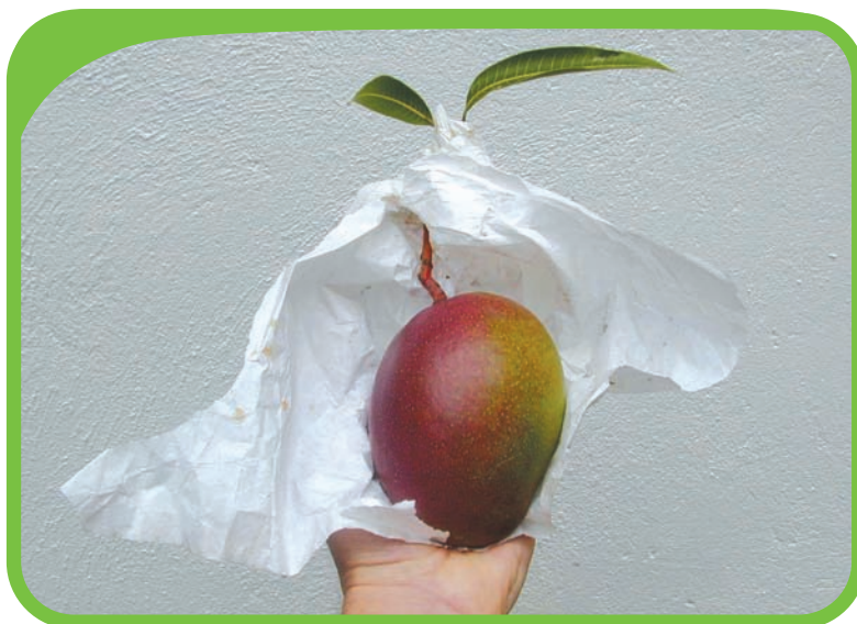
Figure 56: A "Tommy Atkins" mango of superlative quality at harvest. The small-tree system is such that the placement of sleeves over all of the fruits is easily accomplished.