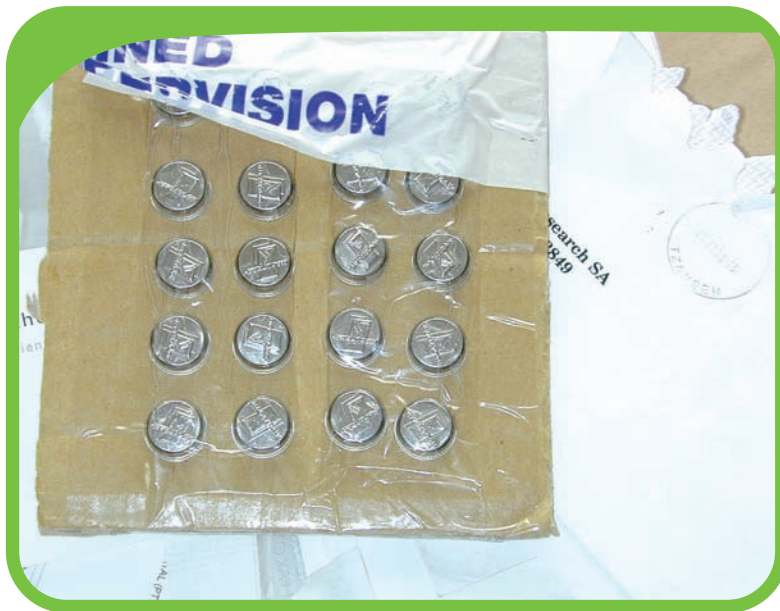
Figure 38: Electronic temperature loggers can be used to log orchard temperatures. A logger is placed in the canopy of one or two trees per orchard block. In each of a number of varieties, a set model has been determined.