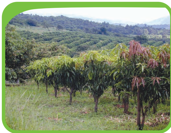
Figure 50: "Tommy Atkins" trees planted at 3 m x 1 m. This is a five-year-old experimental planting at the HortResearch SA research farm in Tzaneen, South Africa.