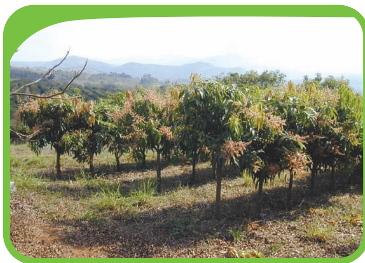
Figure 54: "Tommy Atkins" 3 m x 1 m planting: The trees in flower after canopy size maintenance pruning measures have been carried out. Success of the high-density system requires specific "selective" pruning measures, which are variety and region specific.