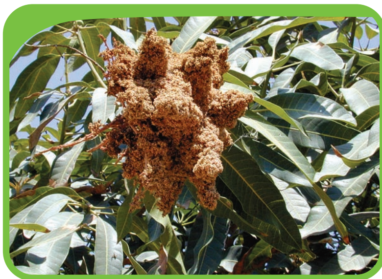
Figure 21: Inflorescence malformation caused by the fungus Fusarium subglutinans .